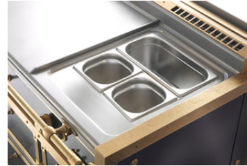
Combination Pasta cooker/Steamer/Bain Marie 400-600mm (Bain Marie shown)