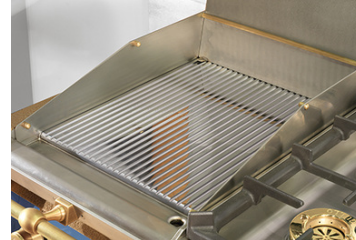
Grooved Griddle 400-600-800 mm