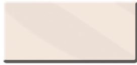
Oyster White 1013