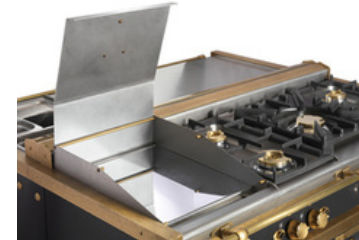
Smooth Chromed Griddle 400 mm