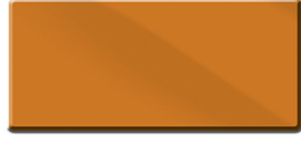
Maize Yellow 1006