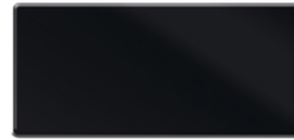
Jet Black 9005