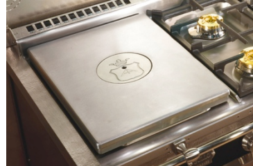
Coup de feu 400-800 mm