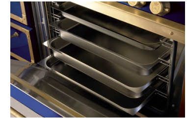
Multifunction stainless steel ovens in GN* sizes