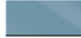
Pastel Blue 5024