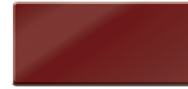
Chianti Red 3005