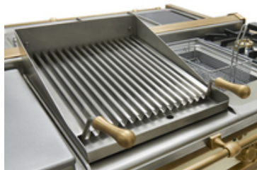
Lava Rock Barbecue 400-800mm