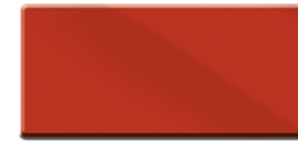
Intenso Orange 2001