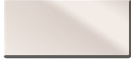
Light Ivory 1015