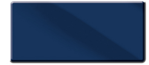
Sapphire Blue 5003