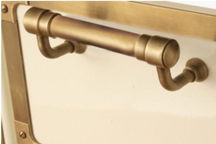
Officine Gullo brass handles