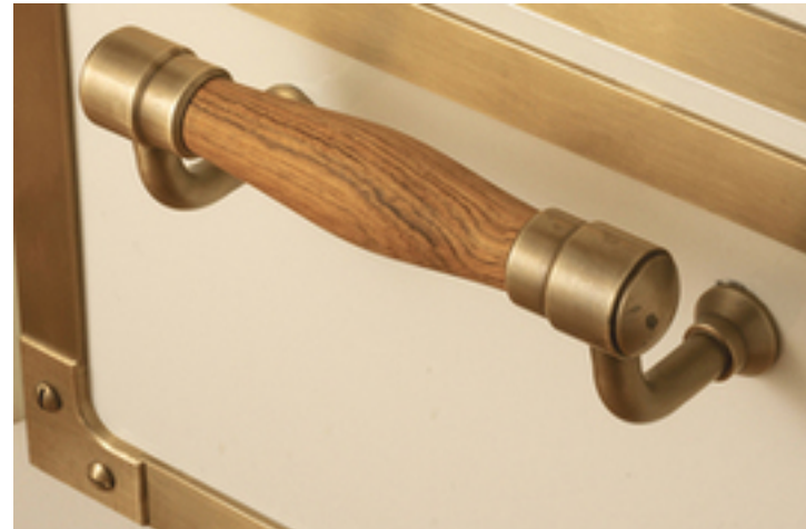
Wooden handles are available in various hardwoods