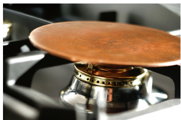
Solid copper simmer plate