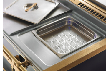
Combination Pasta cooker/Steamer/Bain Marie 400-600mm (Steamer shown)