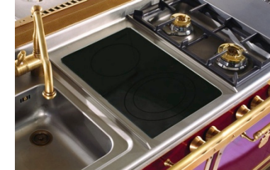
Griddle in glass/ceramic 400 mm