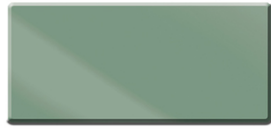
Light Green 6021