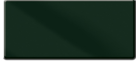
Muss Green 6005