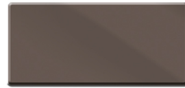
Beige Gray 7006