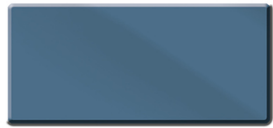
Distant Blue 5023