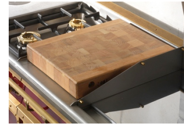
Worktop with removable end-grain chopping board 400mm