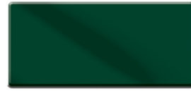
Green Forest 6009