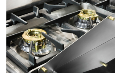
Maxi Burner 10 kW - 35000 Btu's 400mm