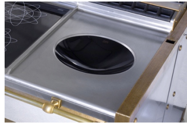
Induction Wok Burner 400 mm