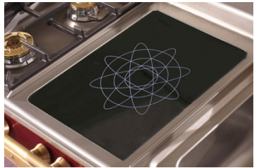
Induction hob 400 mm