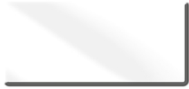
Milky White 9003