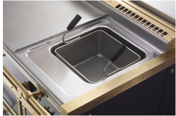
Combination Pasta cooker/Steamer/Bain Marie 400-600mm (Pasta cooker shown)