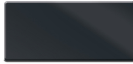
Anthracite Matt 7021