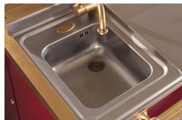
Integrated built-in sink with tap and drain 400mm