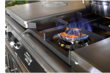
Gas Burners from 3.5 to 5.5 kW - 12,000 to 19,000 Btu's 300-600mm