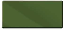
Fern Green 6025