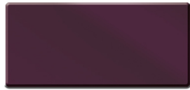
Eggplant Violet 4007