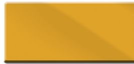
Bright Yellow 1021