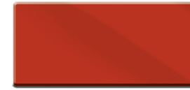
Intenso Orange 2001