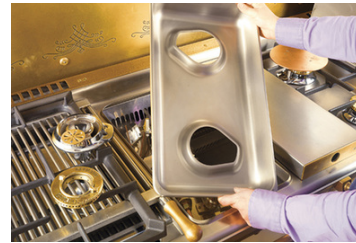
Drip trays that are easily removable and dishwasher safe