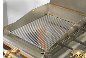
Grooved Griddle 400-600-800 mm