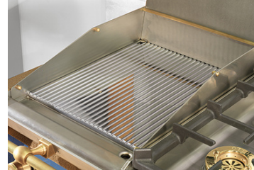
Grooved Griddle 400-600-800 mm